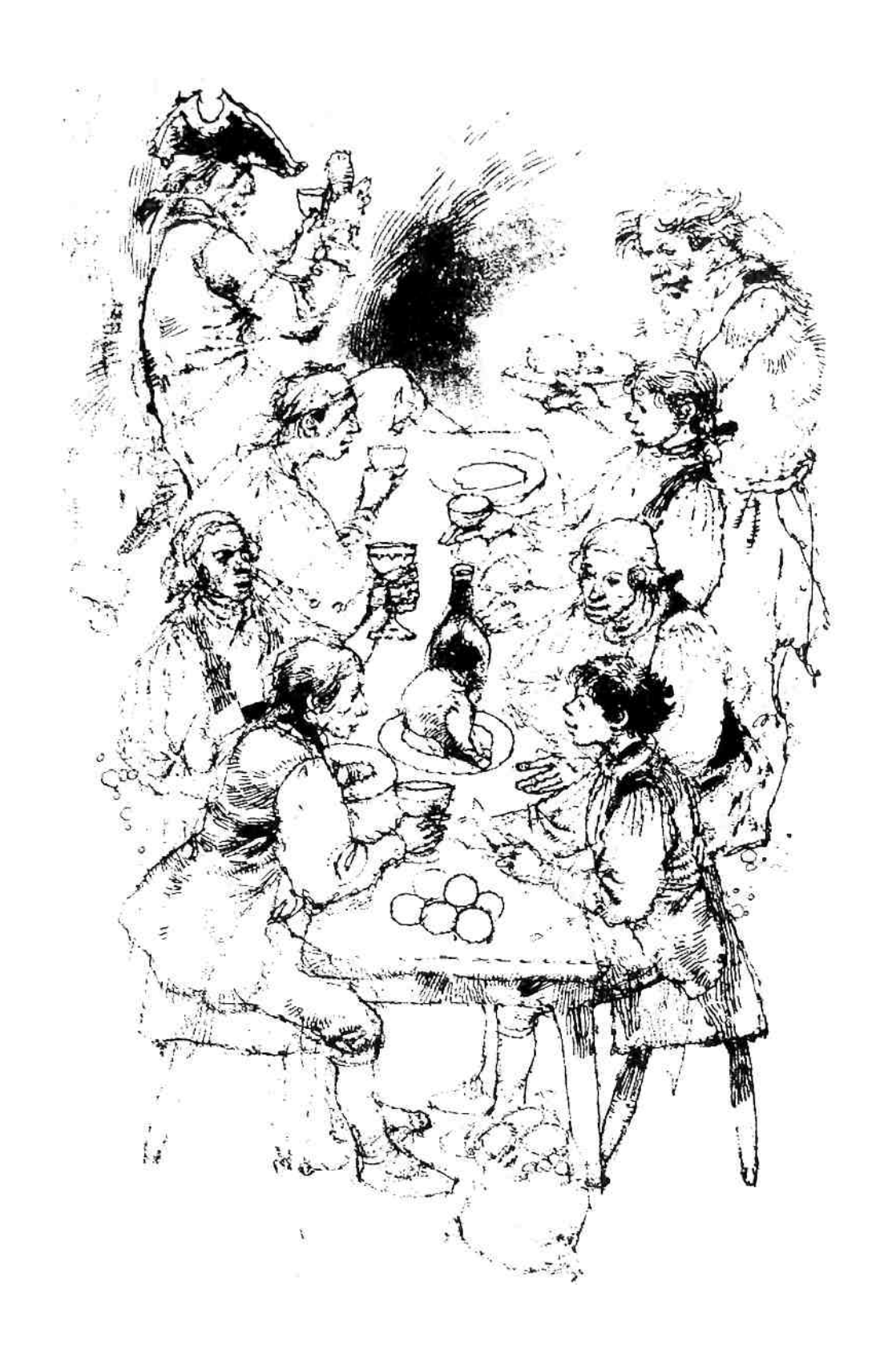
I had a good dinner that night with all my friends.