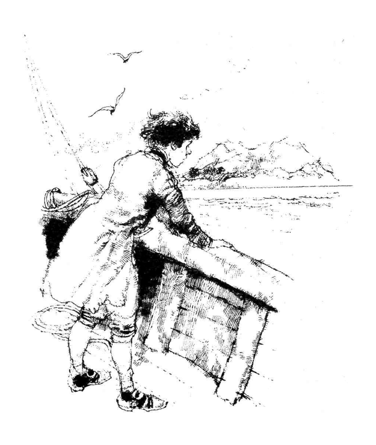
'I know there's a house on the island,' I thought. 'But I can't see it from here.'