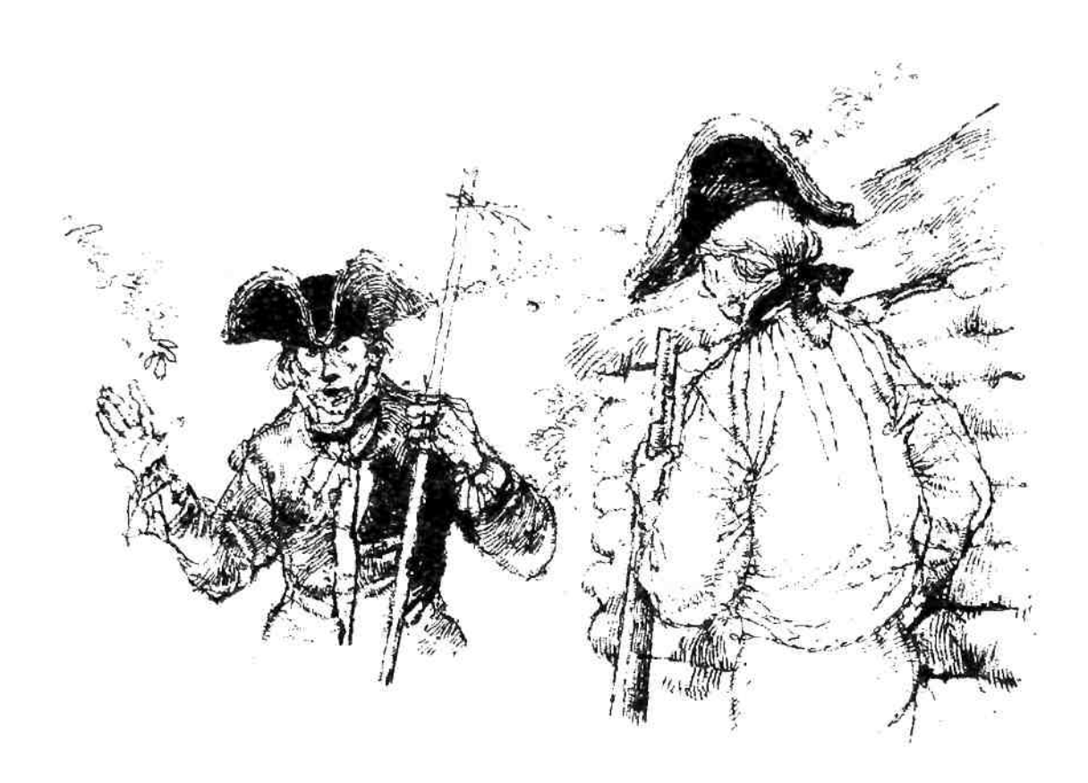
'Captain Silver wants to talk to you,' said Long John.

'We didn't kill that man,' I thought. 'Ben Gunn killed him. Now there are only fourteen pirates.'