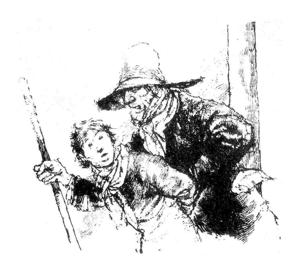
'Now my young friend,' he said, 'take me to the captain. Quickly! I can break your arm.'

The captain looked at the black paper in his hand. Then he read the words on it.