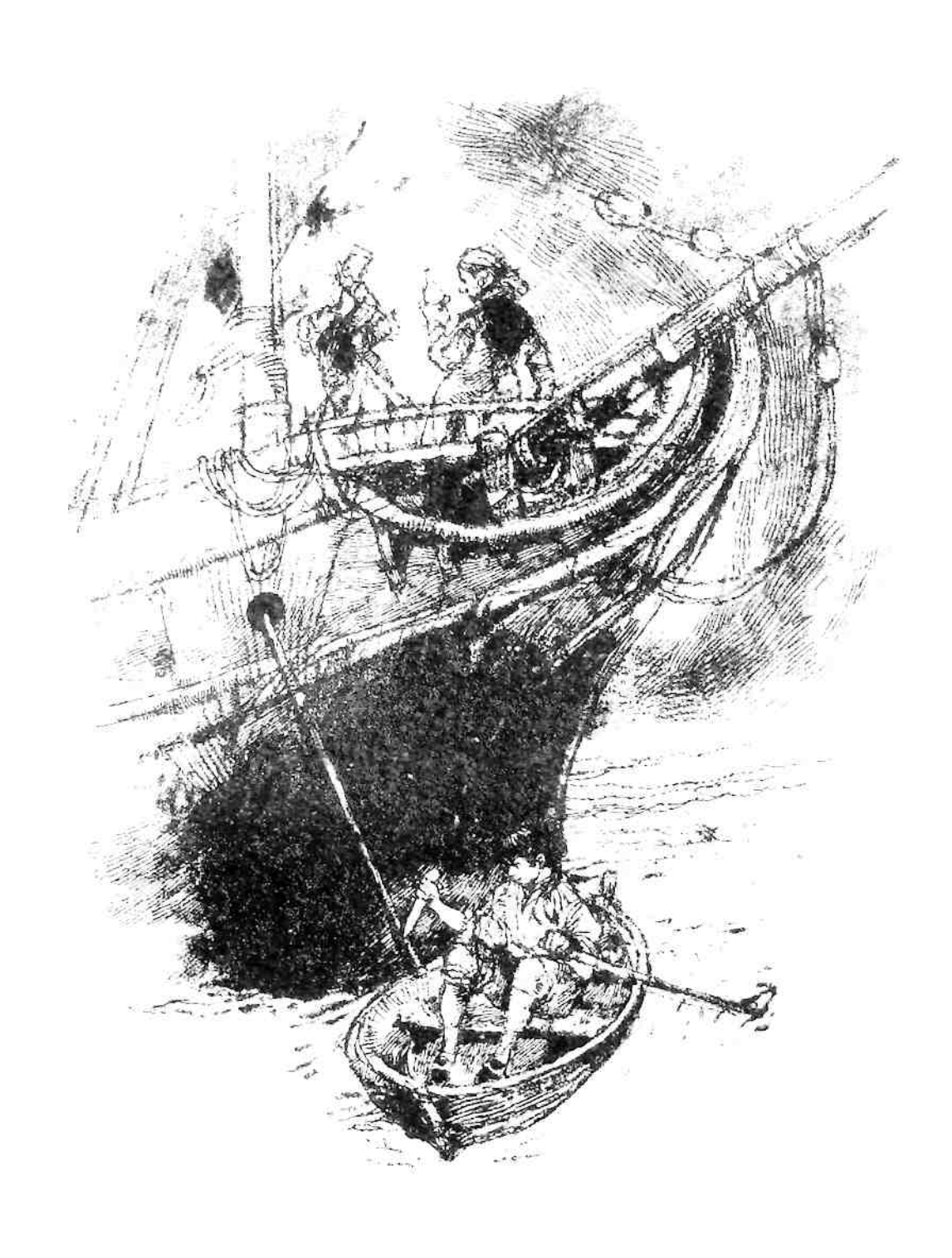
'I can cut the ship's rope with my knife,' I thought.