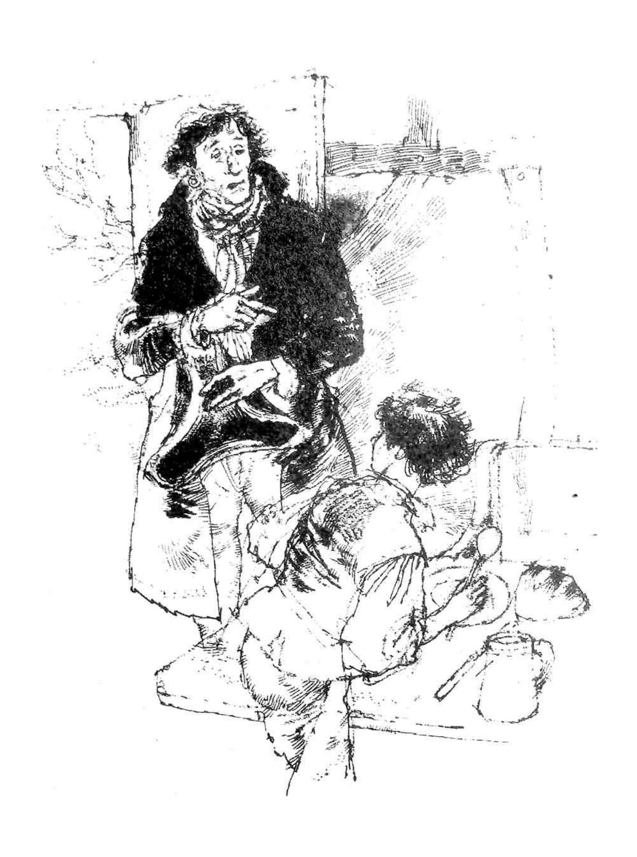
The man looked at the captain's breakfast table. 'Is this table for my friend Bill?'