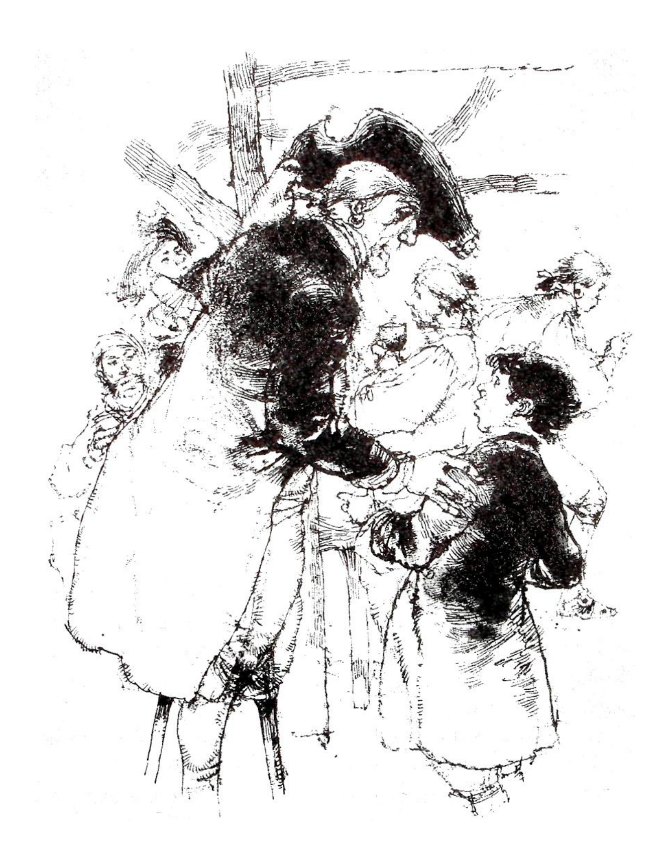
Long John Silver turned to me. 'Who was that man?' he asked. 'Black what?'