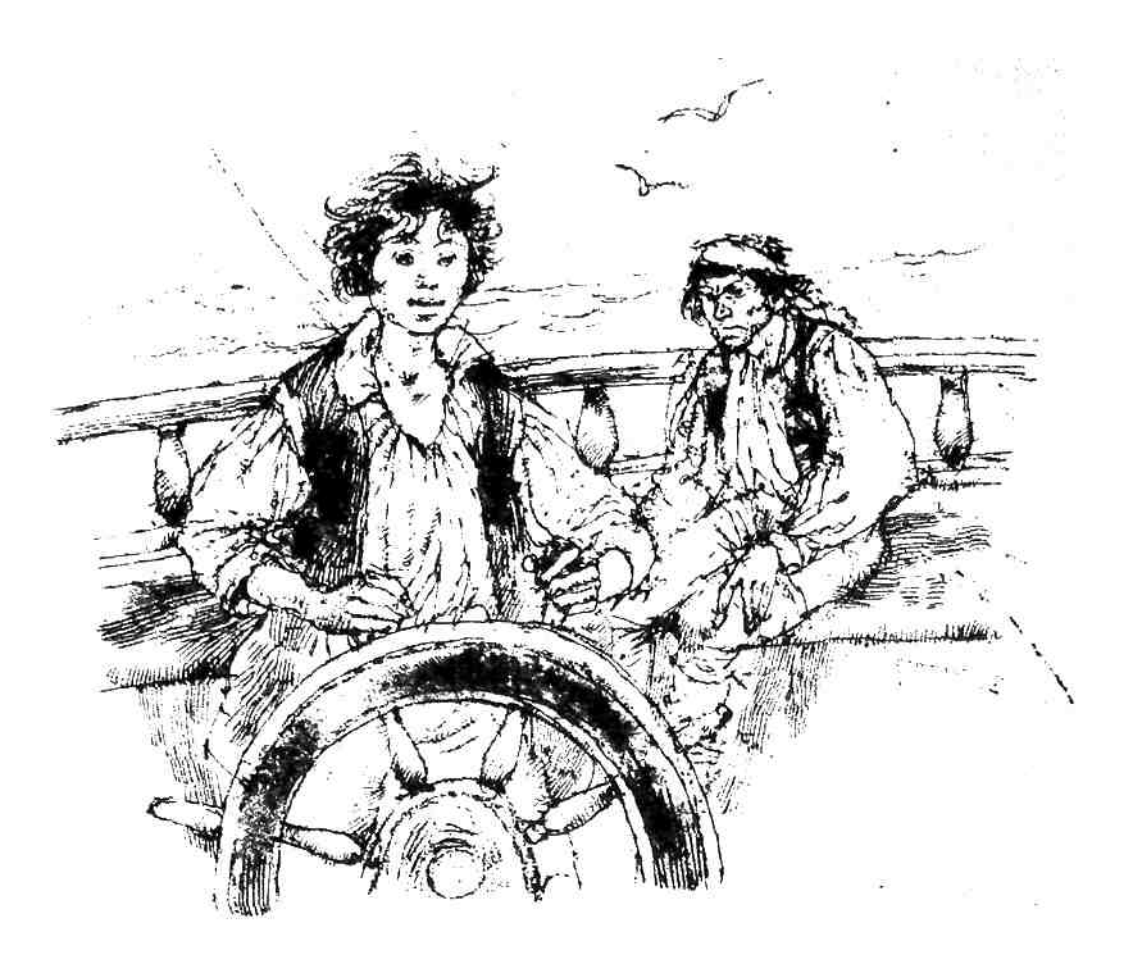
So we sailed to the north of the island. The ship moved quietly through the waters; I was happy.

came to the North Inlet. Hands told me what to do and I brought the ship near the beach. I watched the sails and the sea, but I did not watch Hands. Suddenly I turned and saw him behind me with his knife in his hand. I jumped away and took out my gun. I tried to shoot at Hands but nothing happened. The gun was wet with sea water.