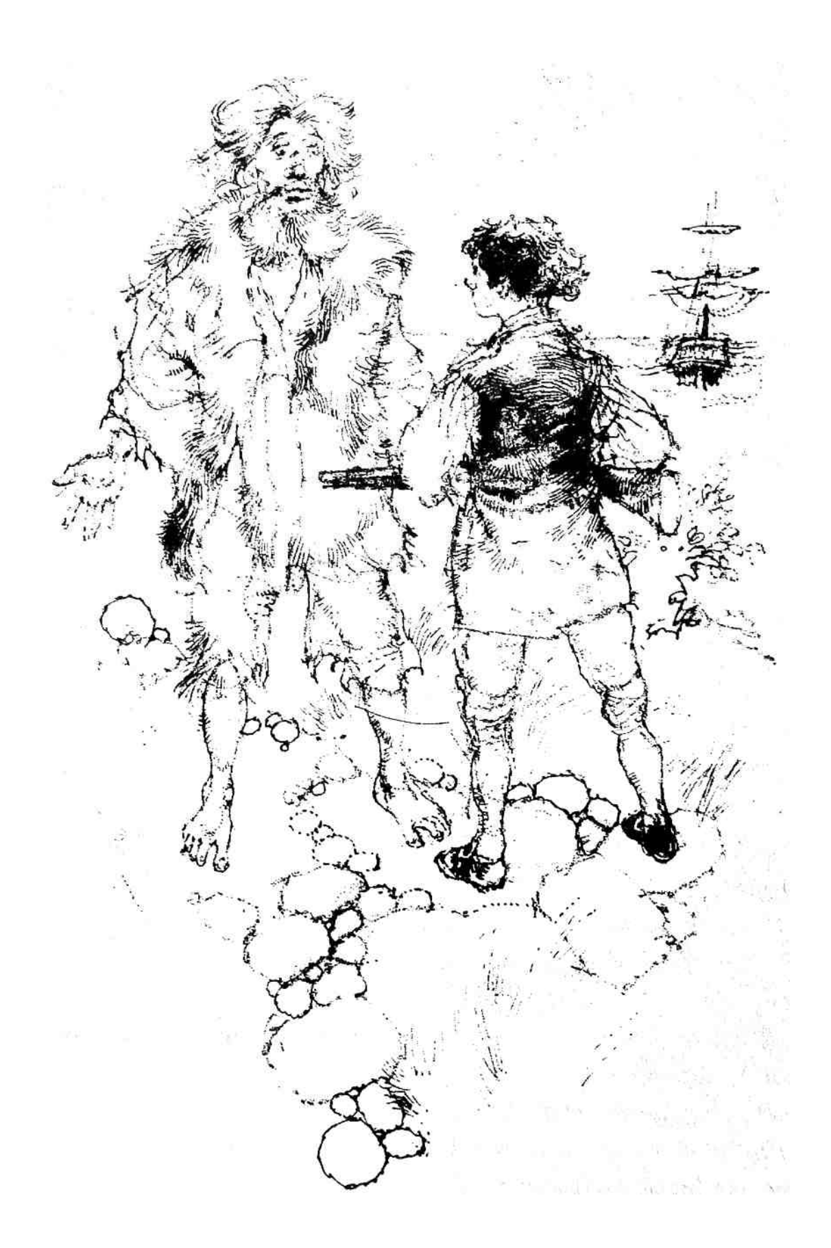
'I'm Ben Gunn,' he said. 'I live here.'