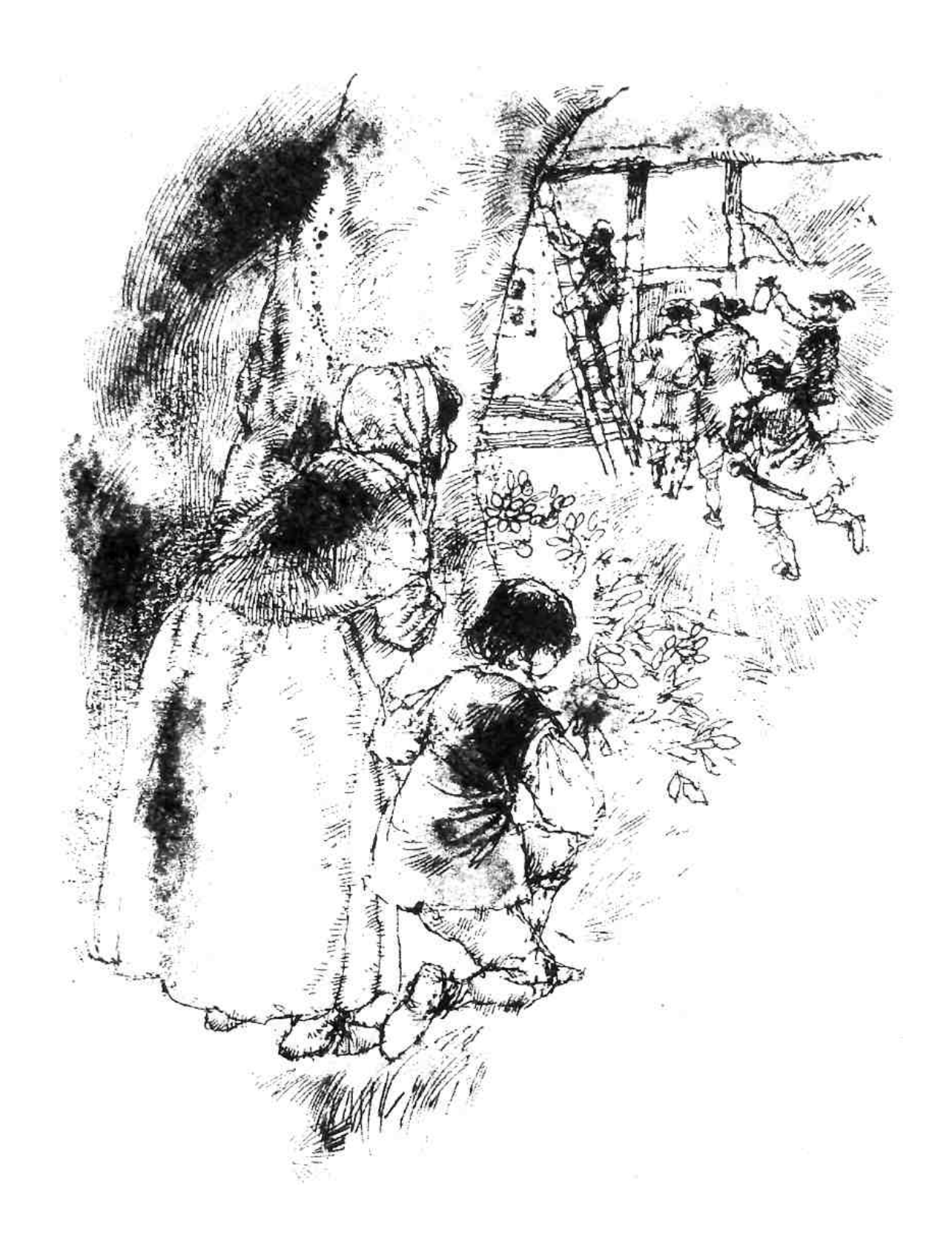
We stopped behind some trees and watched the men.